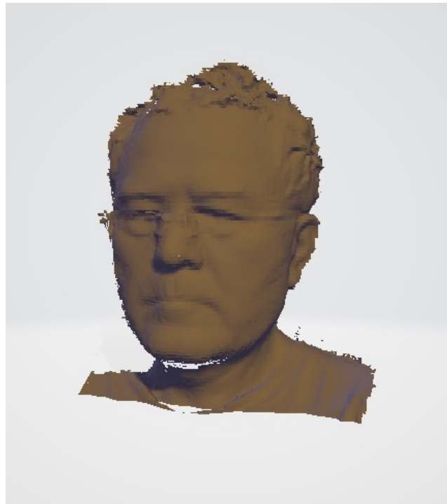
2. Even detailed features can be picked up

Although the initial app was released several months ago, only recent major upgrades give the users the ability to output OBJ files, to use Apple's Files App to share scanned files, and to be able to use more iPhone and iPad models. If you already have the app, you can download the latest upgrade.