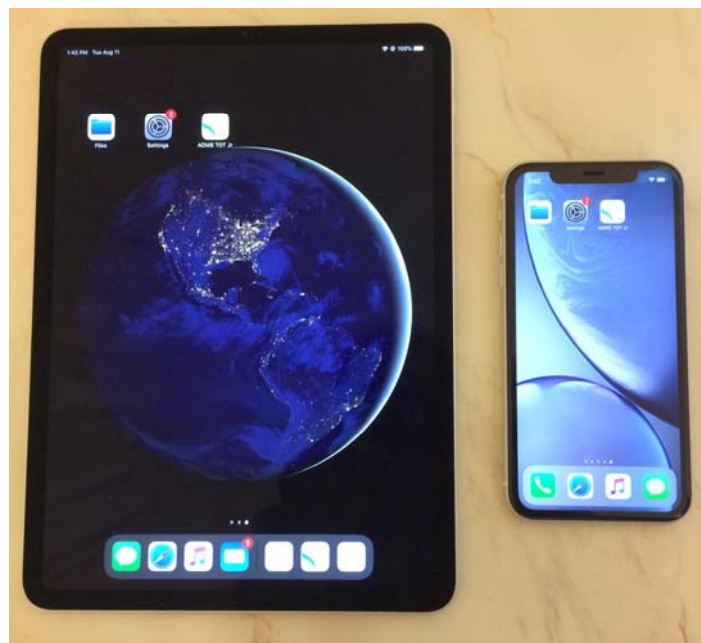
4. The iPad and iPhone used in developing the project

Please make sure you have an iPhone or iPad which has the TrueDepth camera in it before downloading the AOMS TOT jr App. The following 11-inch iPad Pro (2 nd Gen) and iPhone XR shown in the picture were used in our development of this project and these are just two examples.