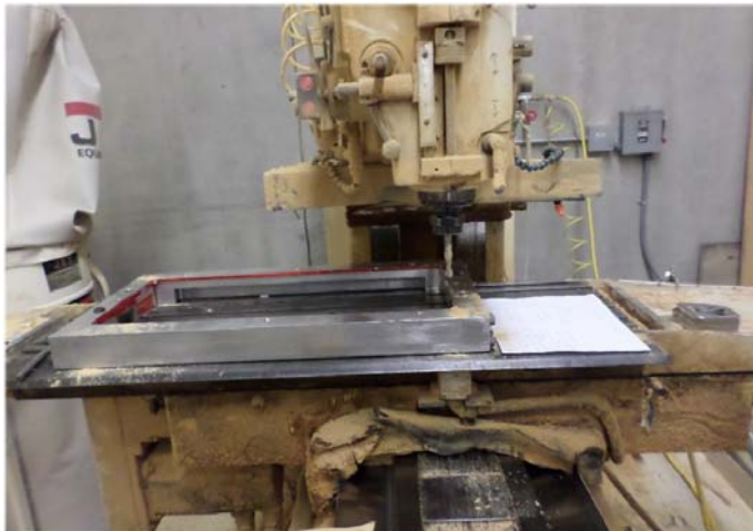
Heavily used CNC mill in AOMS system

If you're considering purchasing an automation system, you really need to investigate Sharp Shape. Our Automated Orthotic Manufacturing System (AOMS) is used in far more labs than any other system. Sharp Shape scanner offers podiatrists the widest variety of lab options. Of course, popularity isn't everything—we also think we have the highest-quality and most cost-effective scanner and system on the market. By conservative estimate, tens of millions of orthotics have been produced from these systems during the past 20 years, under 'no-royalty' policy. Many labs have replaced several CNC machines already.