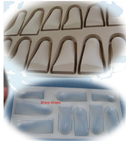
Carved orthotic devices

Can you imagine how much AOMS was used? You must have some experience with the PC keyboard. When you use a keyboard a lot, the top of the keys will become shiny by rubbing and punching. What happens if you keep using it? The letter on the key will gradually faint away and the key become blank. What happens if you still keep using it? The plastic key will be worn through (with a hole on it). Ten years ago, we set up the AOMS system for a large lab. A couple of years ago, we revisited them on an upgrade, we was amazed by the look of the four arrow keys being used. They were blanks. The operator told us that they have replaced six keyboards, and every one of them had holes on the arrow keys. Imagine that! We don't charge royalties. The more you use the system, the more you benefit from it. Someone must have the impression that AOMS is used for large labs. That is a myth. By configuring the system with a low-cost router, you are able to reduce the cost on the system a lot. As result, AOMS is also suitable for some podiatrist/pedorthists groups and shoe stores if you have reasonable volume of production. In the past, a couple of AOMS systems were set up in garages. Please contact us if you are interested.