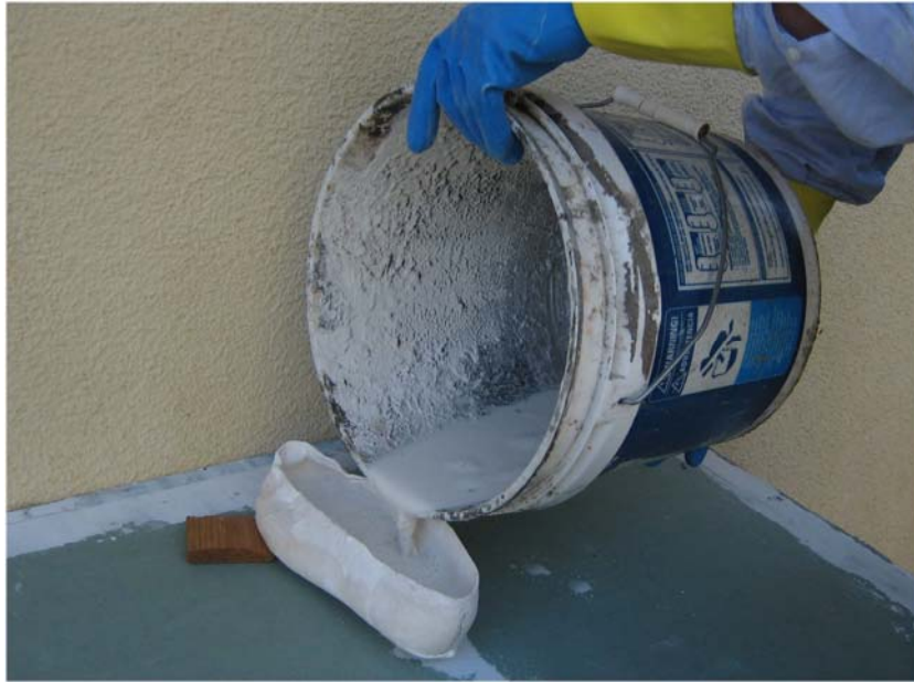
That was then