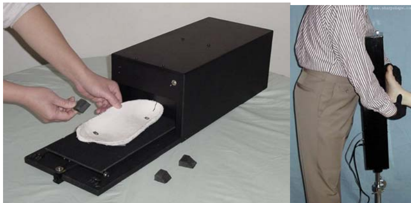
This is now