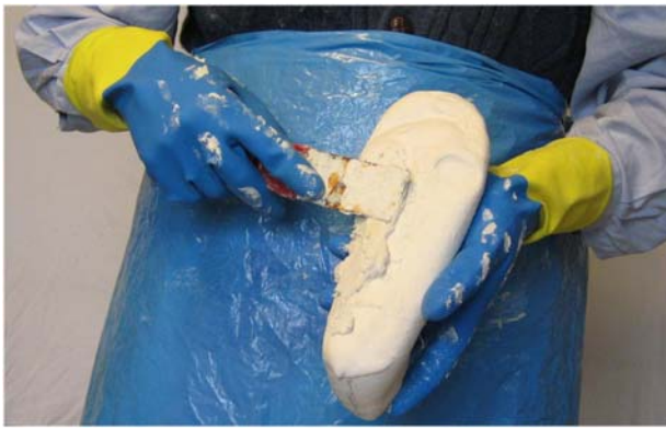
That was then